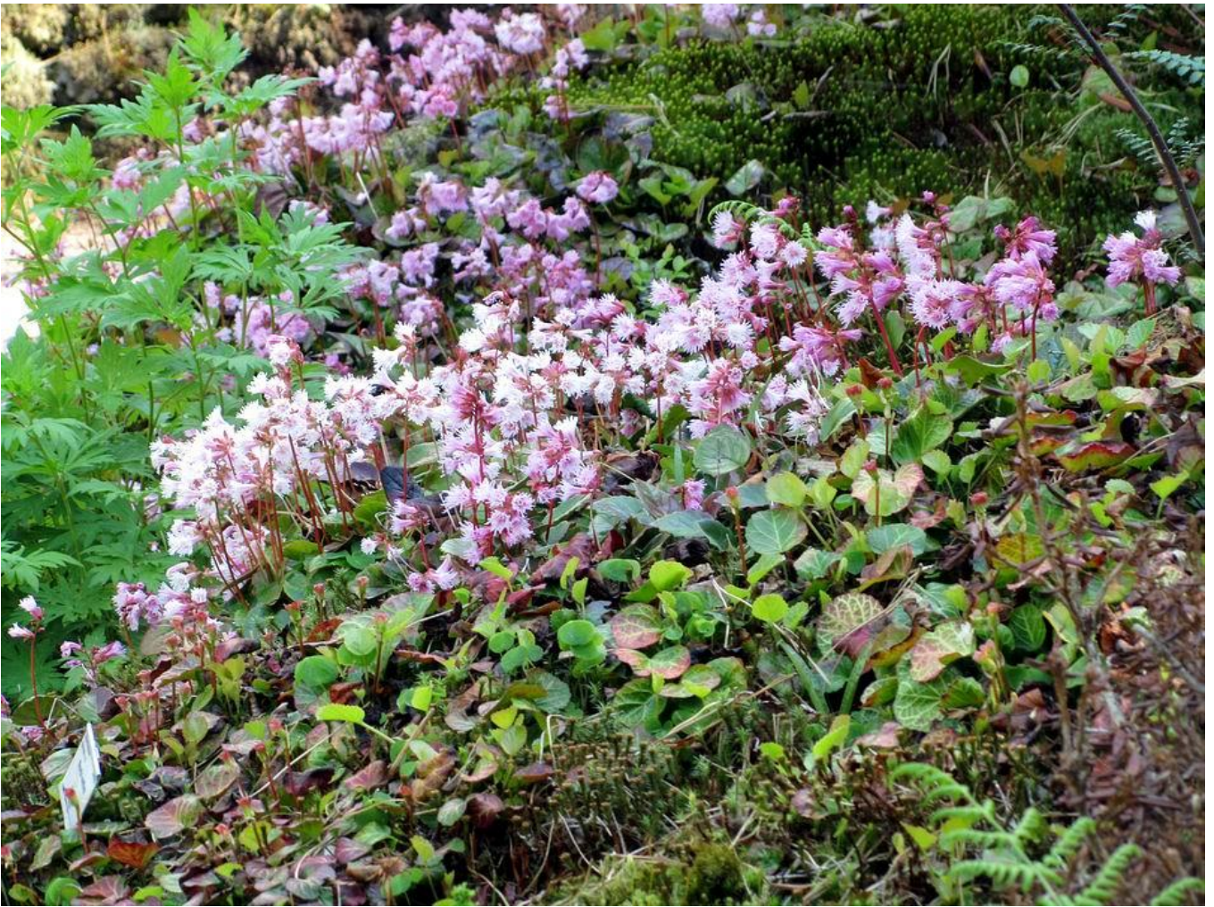
I had time to wander around the garden and search out some of the many treasures such as Shortia growing and self-seeding so well that they are now having to control its spread!!