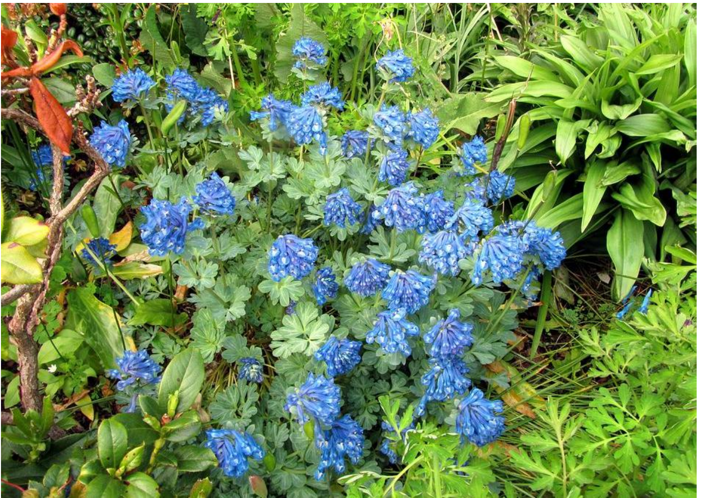
I also saw Corydalis pseudobarbisepela but these pictures are taken in our garden yesterday – I got this plant from Peter Korn some years ago on a previous trip to Gothenburg.