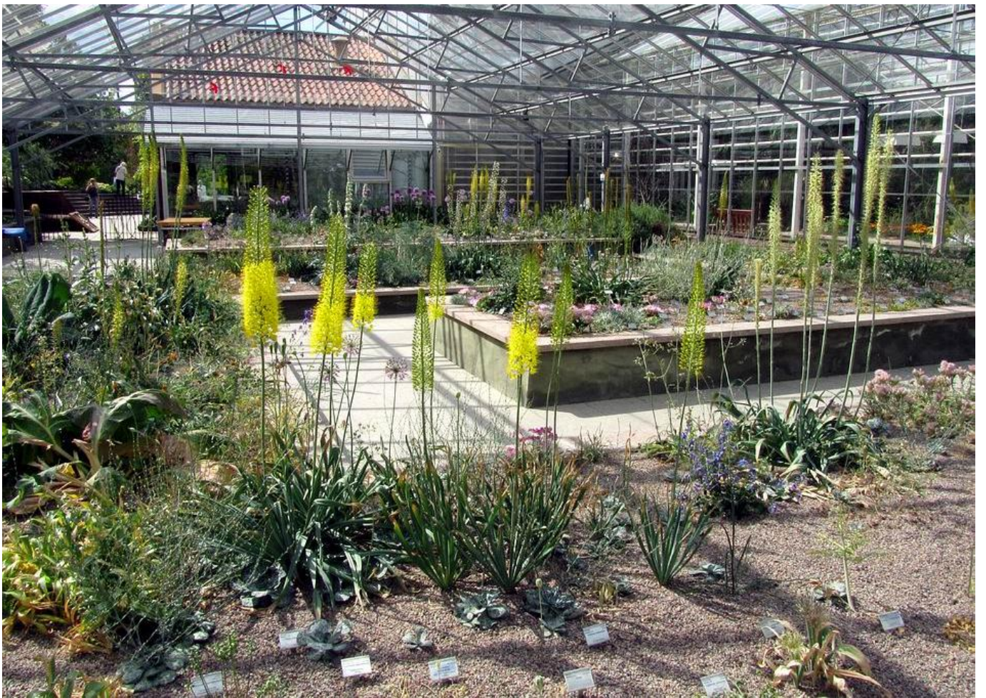
Eremurus features in the bulb house which I am used to seeing full of choice bulbs but just contrast that picture with the one below where it is full of choice gardeners.