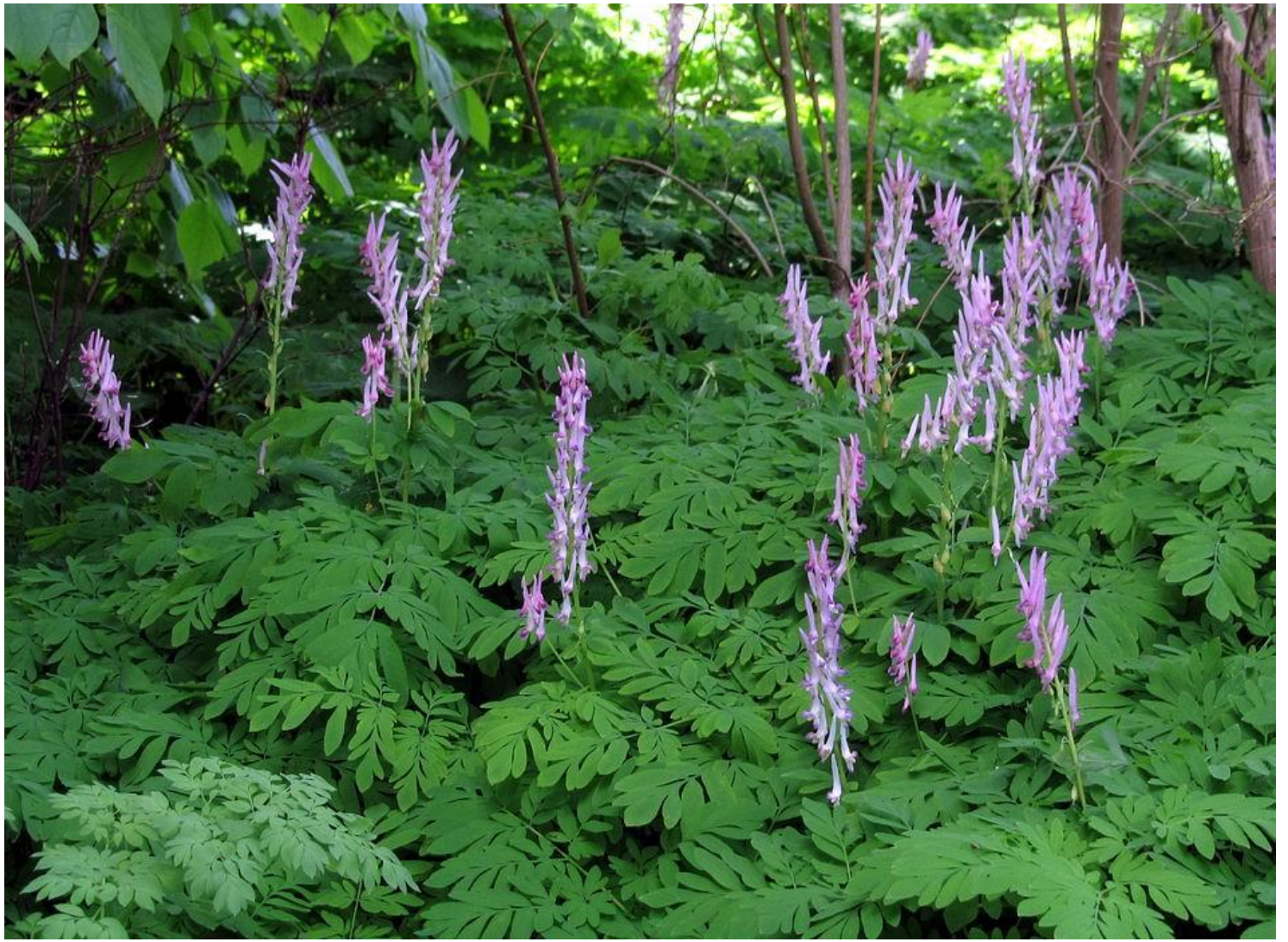
Corydalis scouleri is a beautiful species for a larger garden that can accommodate this fine decorative plant which spreads in such a stately manner under the shade of large trees at the edge of the rock garden.