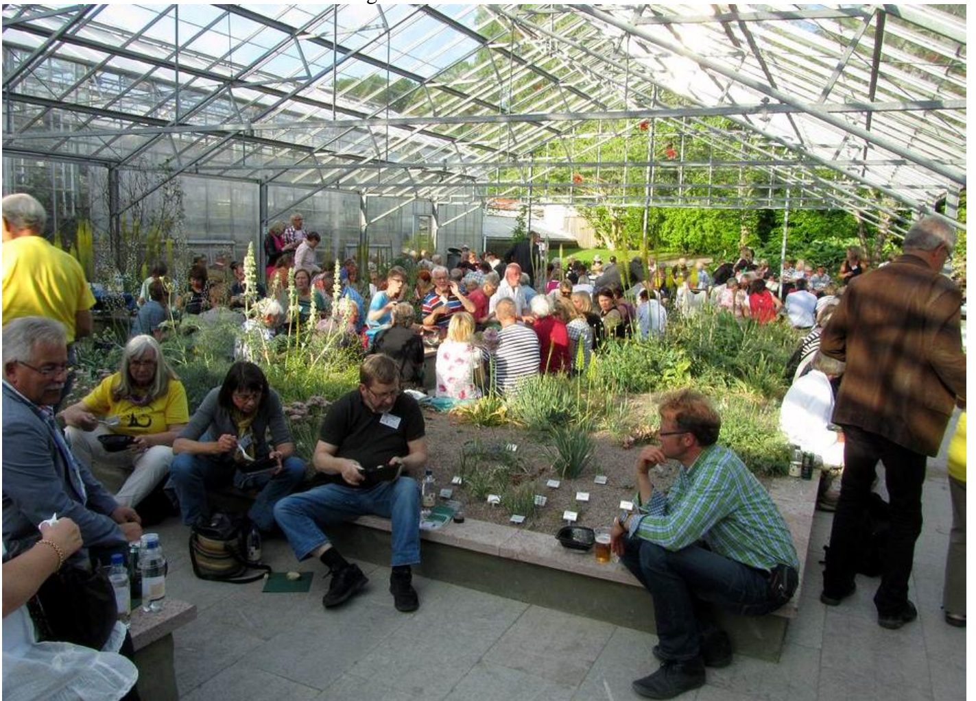
On the Friday evening hundreds of people enjoyed a buffet meal and some drinks in the bulb house giving me a sight that will forever stay in my memory of happy gardeners from Sweden, Norway, Denmark and Germany.