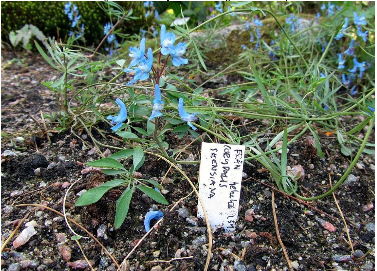
Always I find plants that are new to me and here I was drawn to a fabulous blue corydalis with long narrow leaves – Corydalis shensiana . As it had been recently planted out I suspect these plants are a bit more drawn than they will be in future now they are growing in the open.