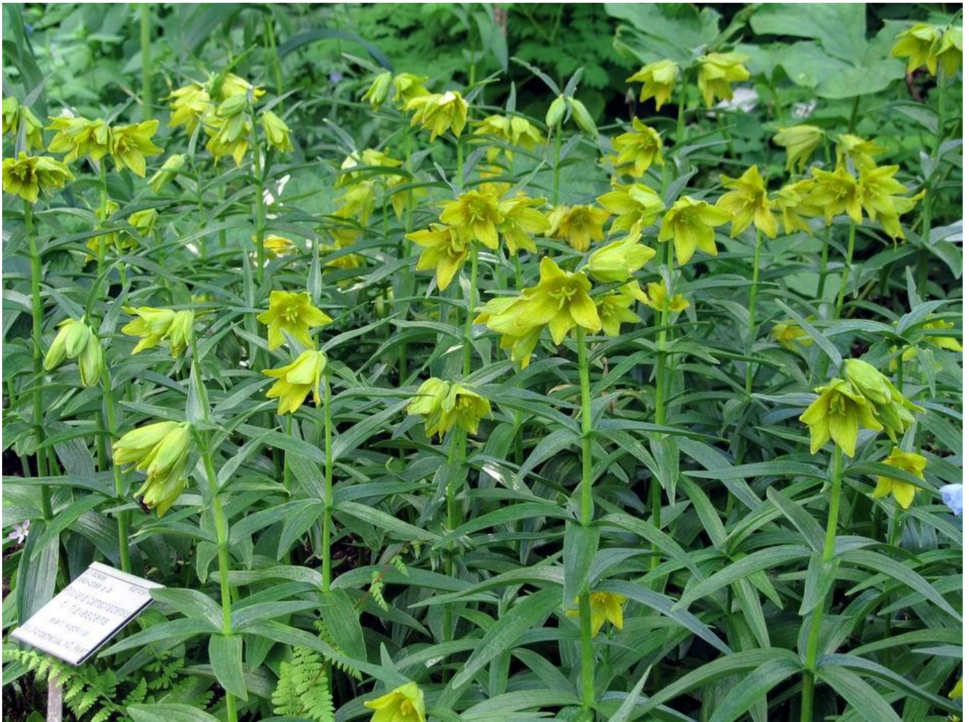
A large group of Fritillaria camschatensis flavescens certainly the largest stand I have seen is also the result of good horticulture.